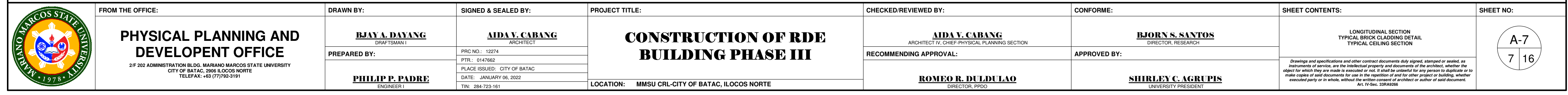
3 TYPICAL CEILING SECTION 1 : 20 meters